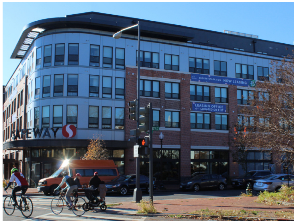
4 STORY MIXED-USE BUILDING DIRECTLY ACROSS THE INTERSECTION TO THE SW